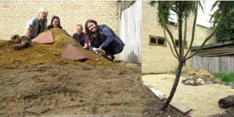
Behind the wall volunteer groups began building the shingle and sand habitats for mining bees and digger wasps.