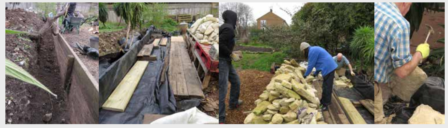
There has been a lot of work out here this year. The ground is cleared of bindweed ready to build the drystone wall, left; the work-space set up with re-used stone; John Holt starts work with students and volunteers.