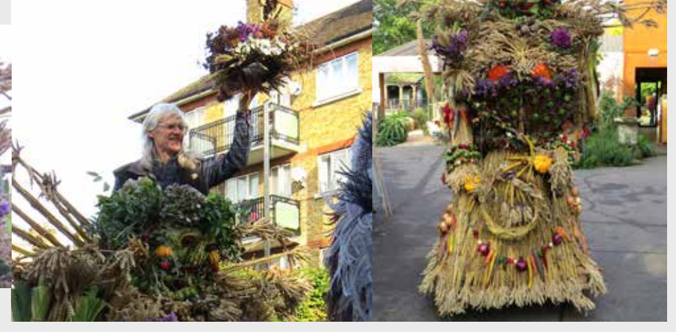
First, we have to get to the start of proceedings - up the Kennington Road to the Imperial War Museum. Here, Sonia begins the celebrations in the Tibetan Peace Garden.