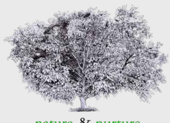
nature & nurture since 1982