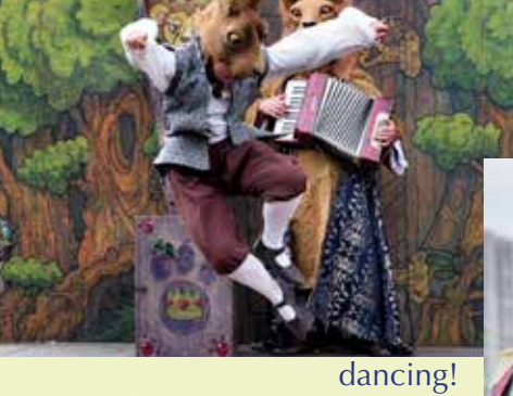
buying and selling