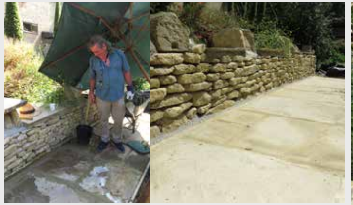
Pat adds to the design by laying more of the slabs in front of the wall as an attractive path (in extremely hot weather). The wall and the main building of Roots complement each other beautifully.