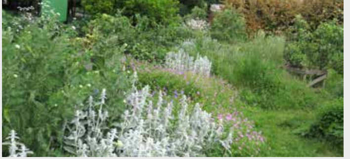
Planting of beds by students in the orchard was varied, attractive and very bee-friendly. Also in the open space we planted a memorial espalier-trained pear tree. It is supported on a structure of sweet chestnut coppice poles (collected from Wilderness Wood in Sussex).